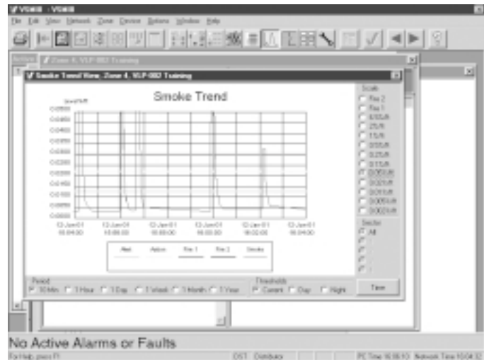
VSM3 Smoke Trend Window