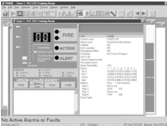
VSM3 Zone Mimic Display

The remote VESDA site also has the ability to initiate a connection with VSM3 when a specific (configurable) condition occurs with the PC Link HLI.