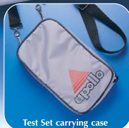
Test Set carrying case